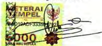
Ign Budhy Darsanto